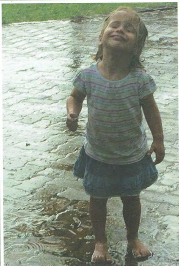
After a long dry season...finally blessed with life-giving rains.

Matthew 5:5 "Blessed are the poor in spirit for theirs is the kingdom of heaven." In the work that I do as a psychiatric nurse practitioner, I see the "poor in spirit" daily. I answer God's call to be a blessing to "the poor in spirit for theirs is the kingdom of heaven."