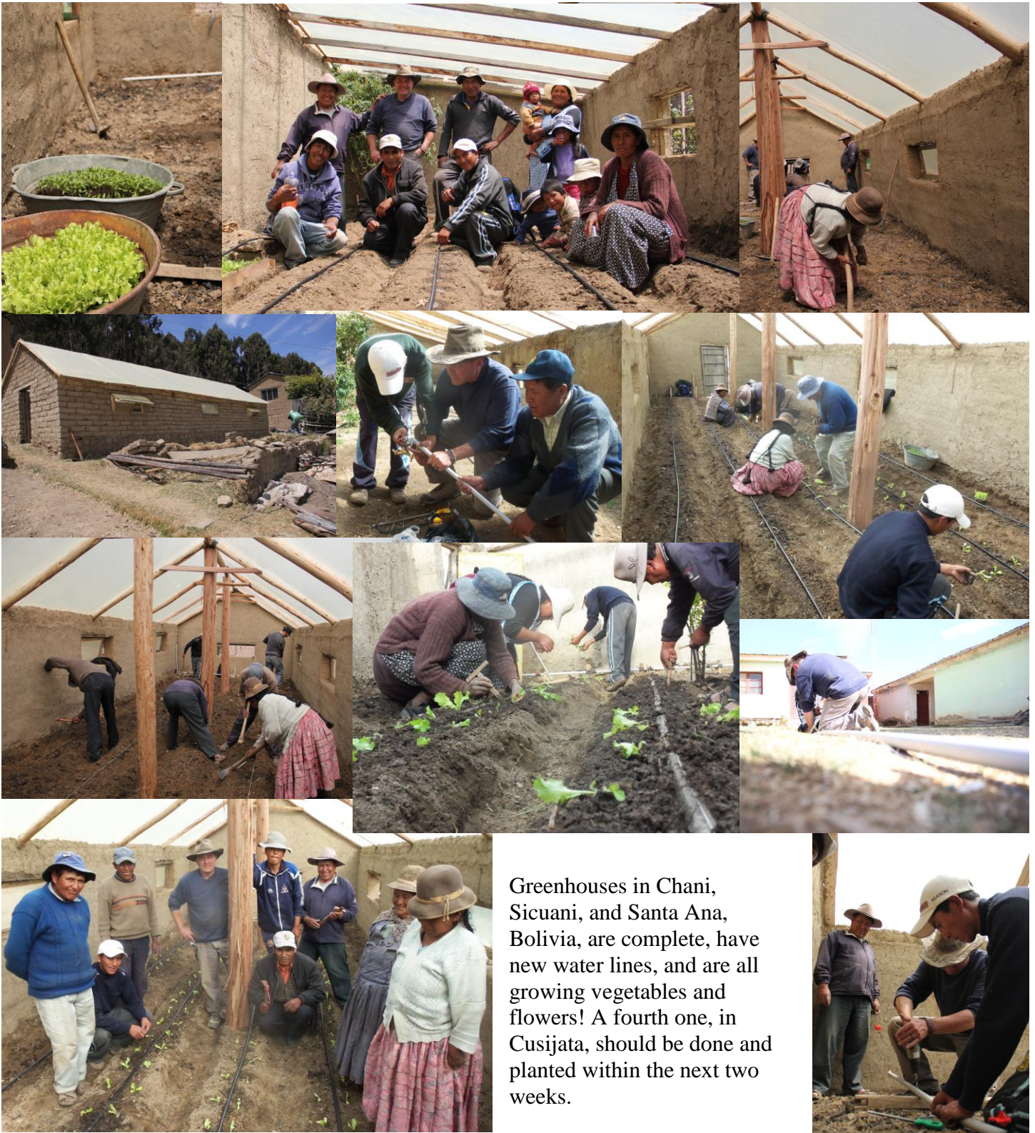
Greenhouses in Chani, Sicuani, and Santa Ana, Bolivia, are complete, have new water lines, and are all growing vegetables and flowers! A fourth one, in Cusijata, should be done and planted within the next two weeks.