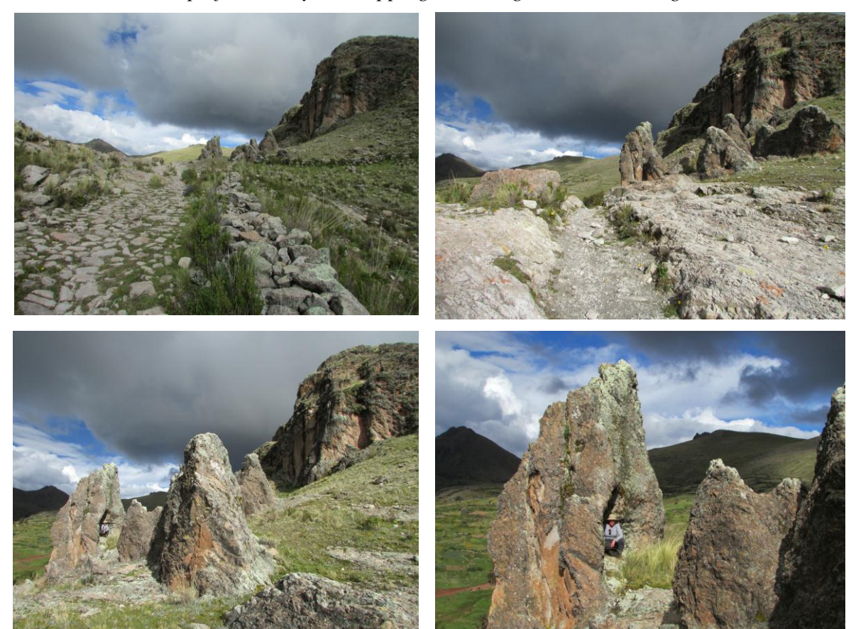
Debbie is tucked in the palm of a hand-shaped rock in the photo at right, and left, too...