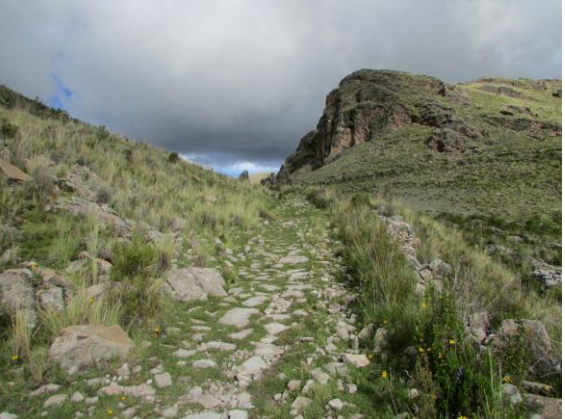
We hiked to the top of the rocky outcropping on the right side, above right.