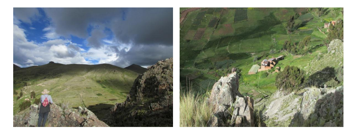
An hour later we reached the high point of our walk for that day (14,970 feet above sea level), called Qullo Kakarachini, amongst even higher mountains yet to be climbed.