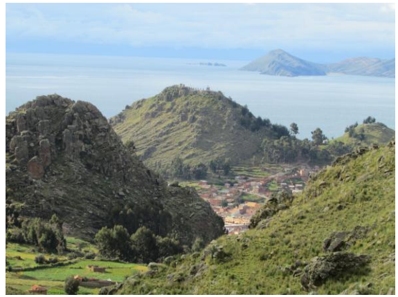
Looking back towards Copa with three famous attractions in a line: From left to right, the peaks of Horca del Inca (Gallows of the Inca), Calvario, and Isla del Sol (Island of the Sun).